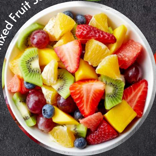
Mixed Fruit Salad