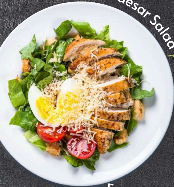
Chicken Caesar Salad