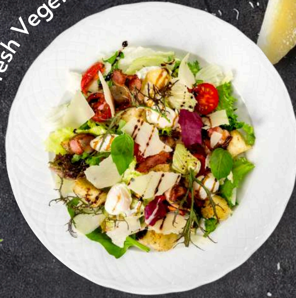
Fresh Vegetable Salad