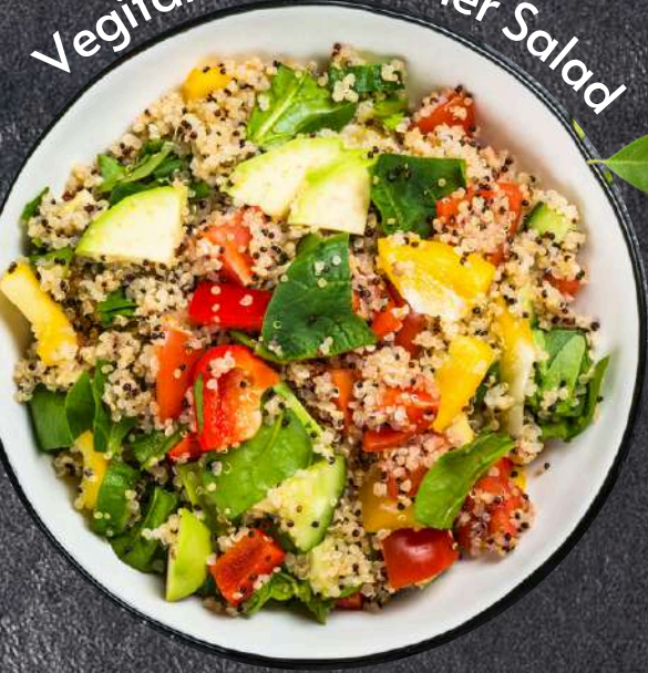
Vegetable Kachomer Salad